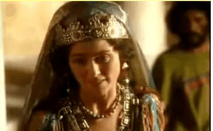
Queen Esther had beauty as potential

seen. With God's guidance even a guardian or any person of good Will would step into the parent's feet and still deliver. Whoever is tired of living should not curtail the chances of innocent children to blossom. Taking children to meet their God prematurely when they are not ready is terrible. The Bible says. “33 "But seek first the kingdom of God and His righteousness, and all these things shall be added to you. 34 "Therefore do not worry about tomorrow, for tomorrow will worry about its own things. Sufficient for the day is its own trouble.” Mat. 6:33-34